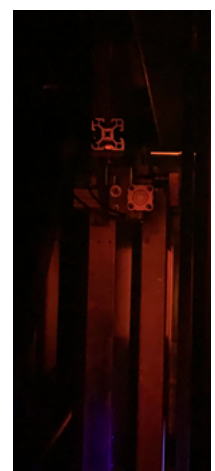
Screen chamber door with safe viewing window