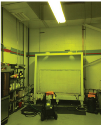
Left: Yellow light washout lab