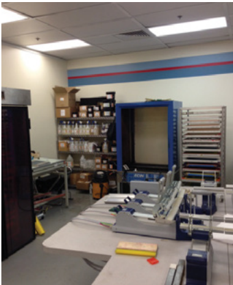
Left: Standard flourescent tube light in screen room